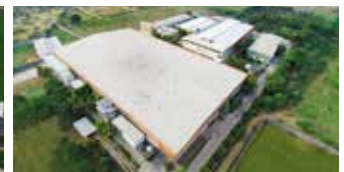
Shakti Hörmann Pvt. Ltd., India

Hörmann is the only manufacturer worldwide that offers you a complete range of all major building products from one source. We manufacture in highly-specialised factories using the latest production technologies. The close-meshed network of sales and service companies throughout Europe, and activities in the USA and Asia, make Hörmann your strong partner for first-class building products, offering "Quality without Compromise".