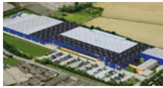
Hörmann KG Brandis, Germany