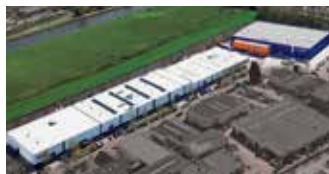
Hörmann Alkmaar B.V., Netherlands