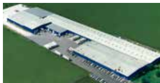
Hörmann LLC, Montgomery IL, USA