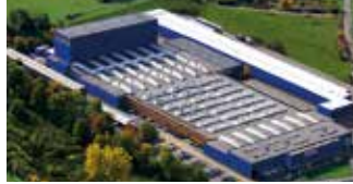
Hörmann KG Freisen, Germany