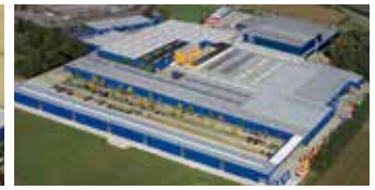
Hörmann KG Brockhagen, Germany