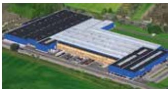
Hörmann KG Werne, Germany