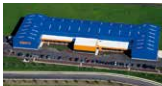
Hörmann Flexon LLC, Burgettstown PA, USA