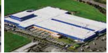
Hörmann KG Ichtershausen, Germany