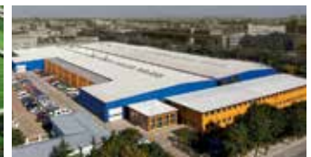
Hörmann Beijing, China