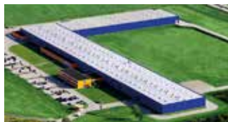
Hörmann Legnica Sp. z o.o., Poland