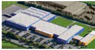
Hörmann KG Antriebstechnik, Germany