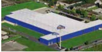
Hörmann KG Dissen, Germany