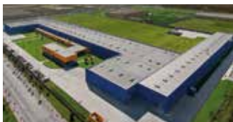
Hörmann Tianjin, China