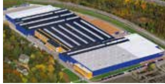
Hörmann KG Eckelhausen, Germany