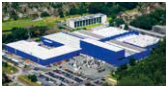
Hörmann KG Amshausen, Germany